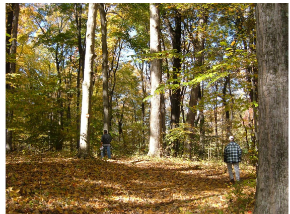
Entering Meshewa Farm's forest

Adjoining 58-acre Turner Farm — well known for its quality farm products — has been permanently protected with an Agricultural CE since Nov. 2002. Turner Farm has been actively farmed since 1795, and has been operated as an organic farm and Community Supported Agriculture partnership since 1994.