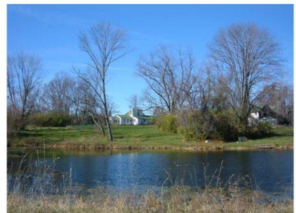
Turner Farm's homestead and new barn